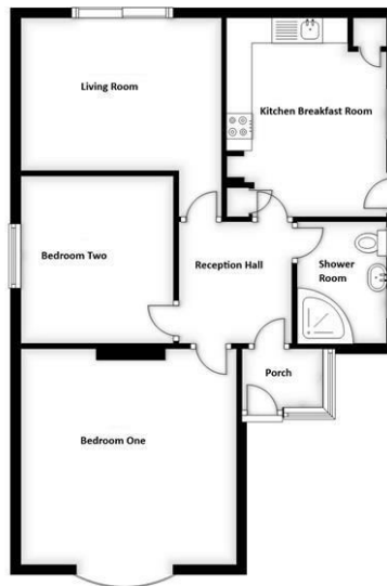
30 Tanhouse Lane, Malvern

These particulars, whilst believed to be accurate are set out as a general outline only for guidance and do not constitute any part of an offer or contract. Intending purchasers should not rely on them as statements of representation of fact, but must satisfy themselves by inspection or otherwise as to their accuracy. No person in this firm's employment has the authority to make or give any representation or warranty in respect of the property.